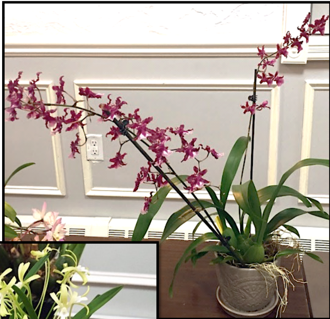
Onc. Heaven Sent 'Sweet Baby' Caron Savone