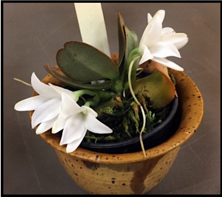
Aerangis fastuosa