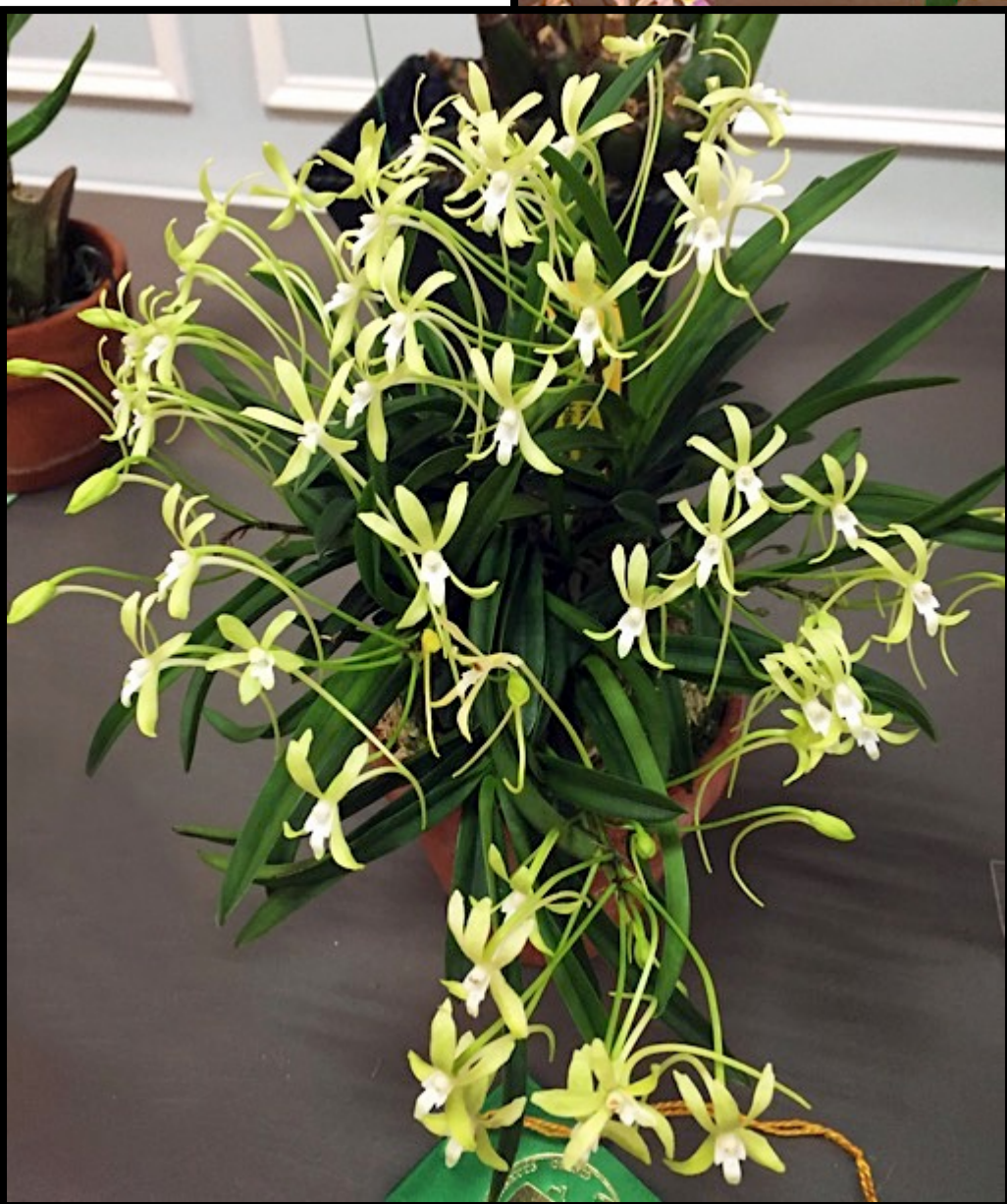
Neofenitia Hisui