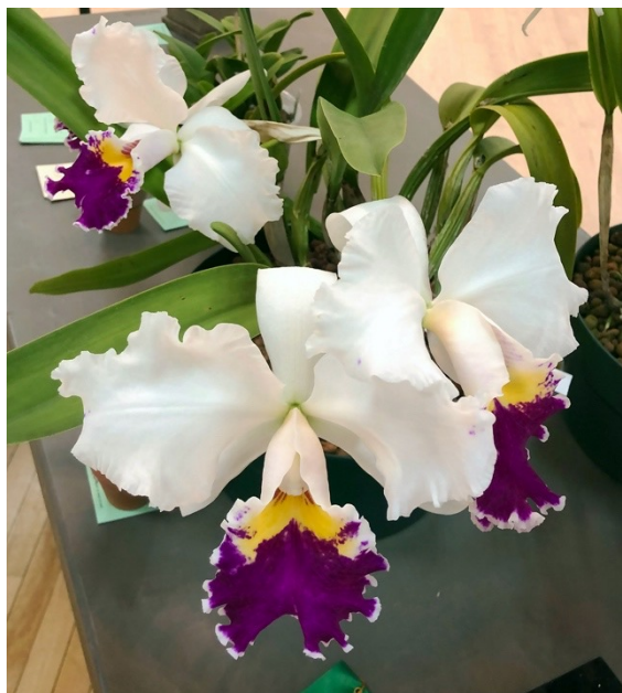
C. trianae