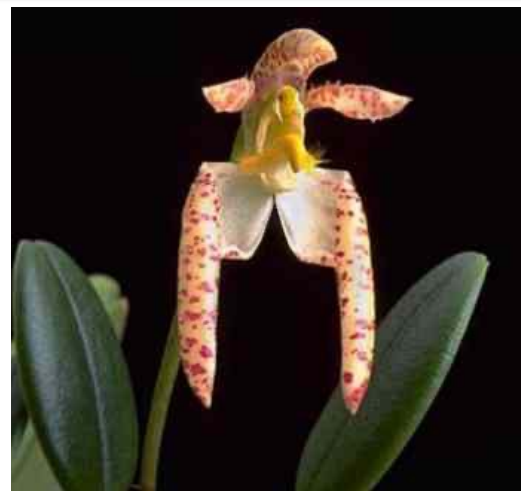
Bulb. lasiochilum