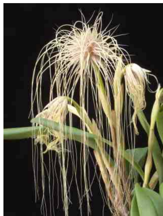
Bulb. medusae