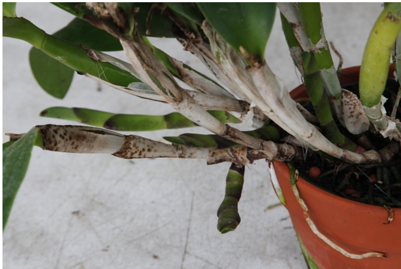
Repot. This cattleya has new leads growing horizontally outside the pot and should be reoriented vertically in a new pot.

Don't repot unless you have a reason to repot. Each time you disturb your plant's roots, it will go through transplant shock and take some period of time to recover. You can minimize the transplant shock by repotting just before your plant starts throwing off new roots. You can also help your plant recover from transplant shock by adding root stimulating hormones when repotting. Some people spray seaweed, Superthrive or other root stimulants on the bareroot plant or add these supplements to their water/fertilizer mix for the next month or so. I add a protective drench of the fungicide Banrot plus seaweed after repotting to minimize the inevitable damage that occurs during the repotting process.