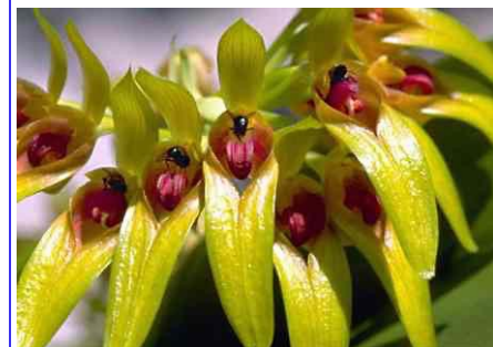
Bulb. graveolens (syn. Cirrhopetalum ) graveolens