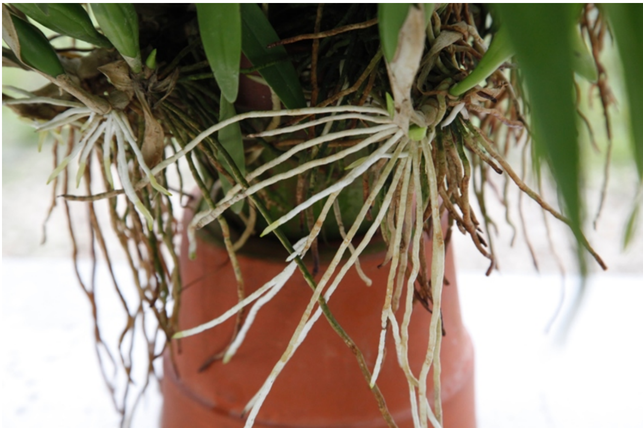
Repot. This Encyclia radiata will be happier in an 8 inch bulb pot.

We get more questions about repotting than any other subject. Some folks never repot their orchids because they are intimidated by the whole process, so their potting mix ultimately rots causing their roots to rot and their orchids are well on their way to orchid heaven. Other folks repot their orchids several times a year because they say their plants are just not blooming for them. Their plants never get a chance to get established, so they too will soon find their way to orchid heaven. There are really only three reasons I can think of to repot an orchid.