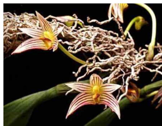
Bulbophyllum affine