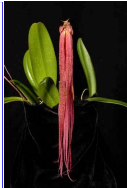
Bulb. plumatum 'A-doribil' AM/AOS

Predominately tropical or subtropical, although the range can extend into temperate regions. A few dozen species are found in the New World (South and Central American and the Caribbean). Several hundred species are found in equatorial Africa and the island of Madagascar. Most species are found in Asia; ranging from the foothills of the Himalayas (2500 m) in Indochina, down through Southeast Asia, Malaysia, the Philippines, Indonesia (especially Java, Borneo, Sumatra, Sulawesi), New Guinea, Australia, and New Zealand. The island of New Guinea, which has at least 600 species, is believed to be the dissemination point for the genus. Since Bulbophyllum species are a very diverse and wide ranging group of orchids, only general culture can be given. The grower should try and obtain habitat information for his/her species of interest.