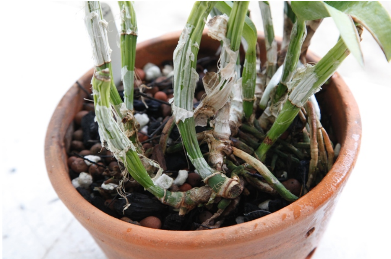
Repot. This cattleya looks very unhappy and is wobbly in the pot. It needs fresh mix.

If you repot your orchids into your mix of choice when they first enter your growing area, you will know when you repotted them and how long they should grow well in that mix. You can water all your similar type orchids in the same mix at the same time without water logging or dehydrating them. It makes taking care of your orchids much simpler.