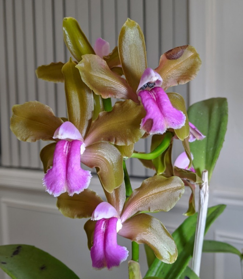
C. bicolor