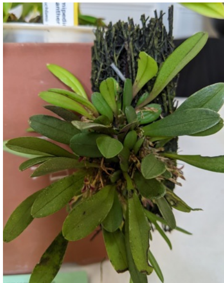
Pleurothallis polynoidae