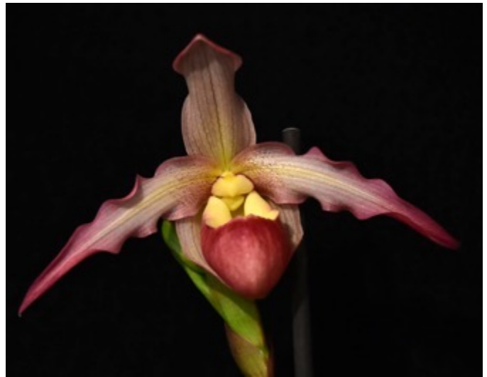
Phrag. Baerbel, Millard H.