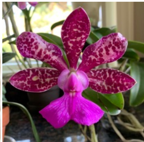
C. measuresiana