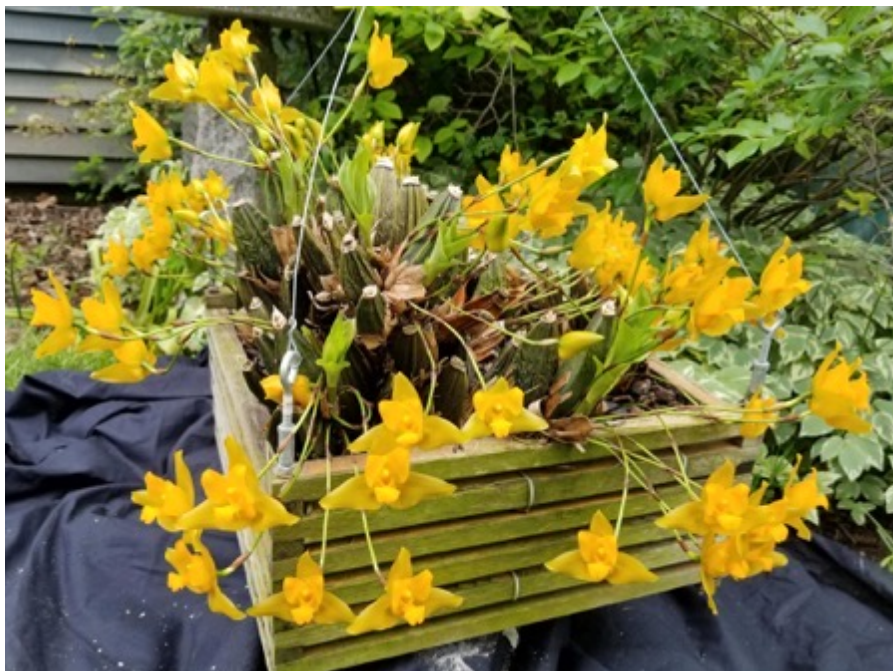
Lycaste aromatica