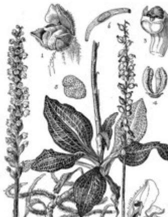
Far Right: Blanche and Oakes Ames Right: detail of Ames drawing

A women's rights activist, artist and inventor, Blanche Ames illustrated the taxonomy of her husband's publications on new species of orchids, producing hundreds of outstanding line drawings of orchids.