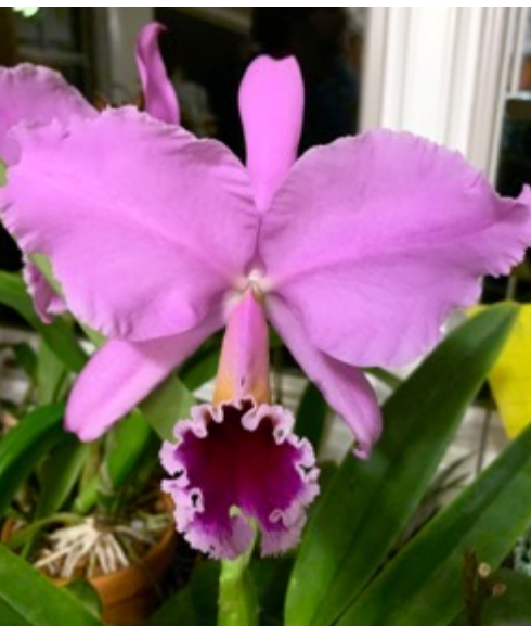
C. percivaliana 'Orchid Ranch'