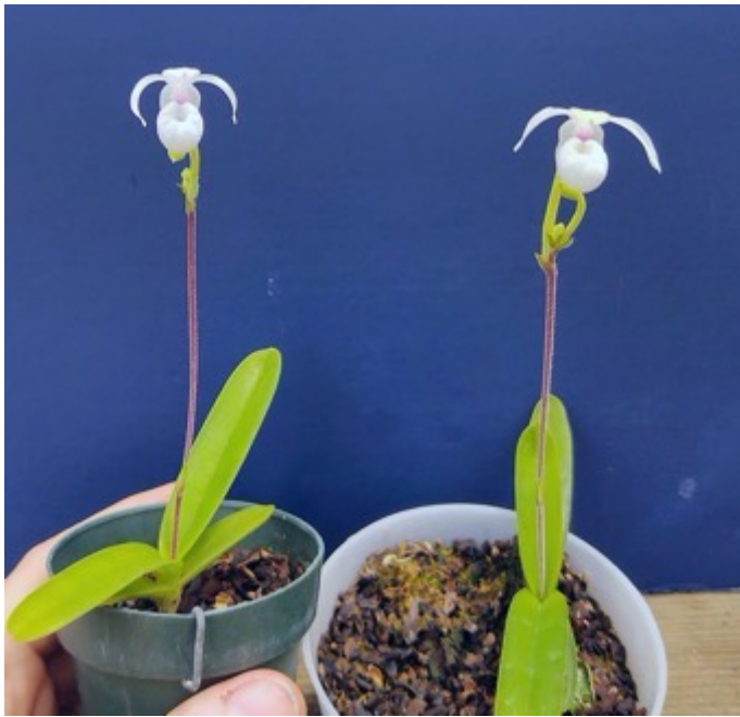
Mxdm. xerophyticum, Daryl Y.