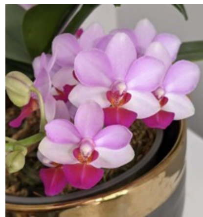
Phal. Berry, Amanda L.