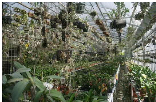
Orchids that are mounted or growing in baskets have roots more exposed to the air than those growing in pots, although they have to be watered more frequently.

environment with low humidity, a water retentive mix with organic matter may be a better choice. Whichever potting mix you select for a given type of orchid, make sure that all similar plants are in the same mix so they can all be watered at the same time. If you have one cattleya growing in sphagnum, one in bark and one in lava rock, are you going to feel each pot individually so you only water that pot when the mix is dry?