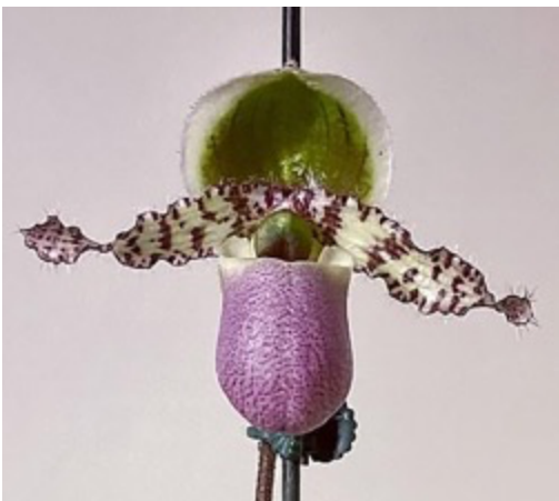
Row 3: Paph. Liemianum (Diresh), Paph. Saiun '#3' x Paph. rohtschildianum (Badia), Paph. Magic Mood 'Sweet Surander' x Emerald Lake 'C.H. #5' (Fortin)