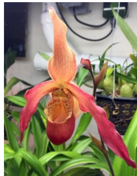
Phrag. Fliquet 4N, Brigitte Fortin