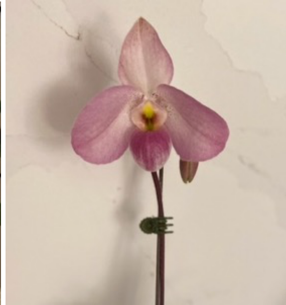
Paph. Ho Chi Minh, Ron Maloney