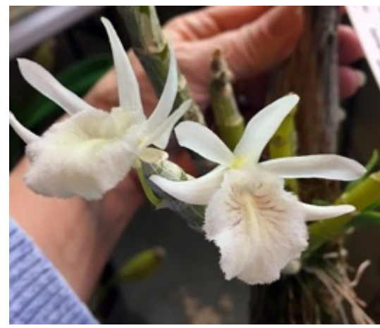
Den. primulinum albescens, Brigitte Fortin