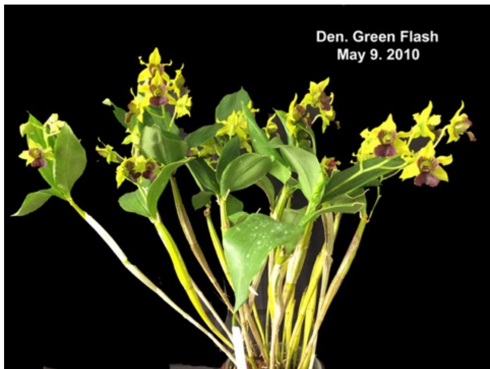
Den. Green Flash May 9, 2010