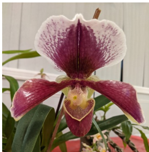
Paph. appletonianum, Cindy Sykes