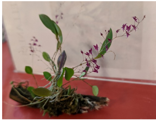
Lepanthopsis astrophora, Meg Bright-Ryan