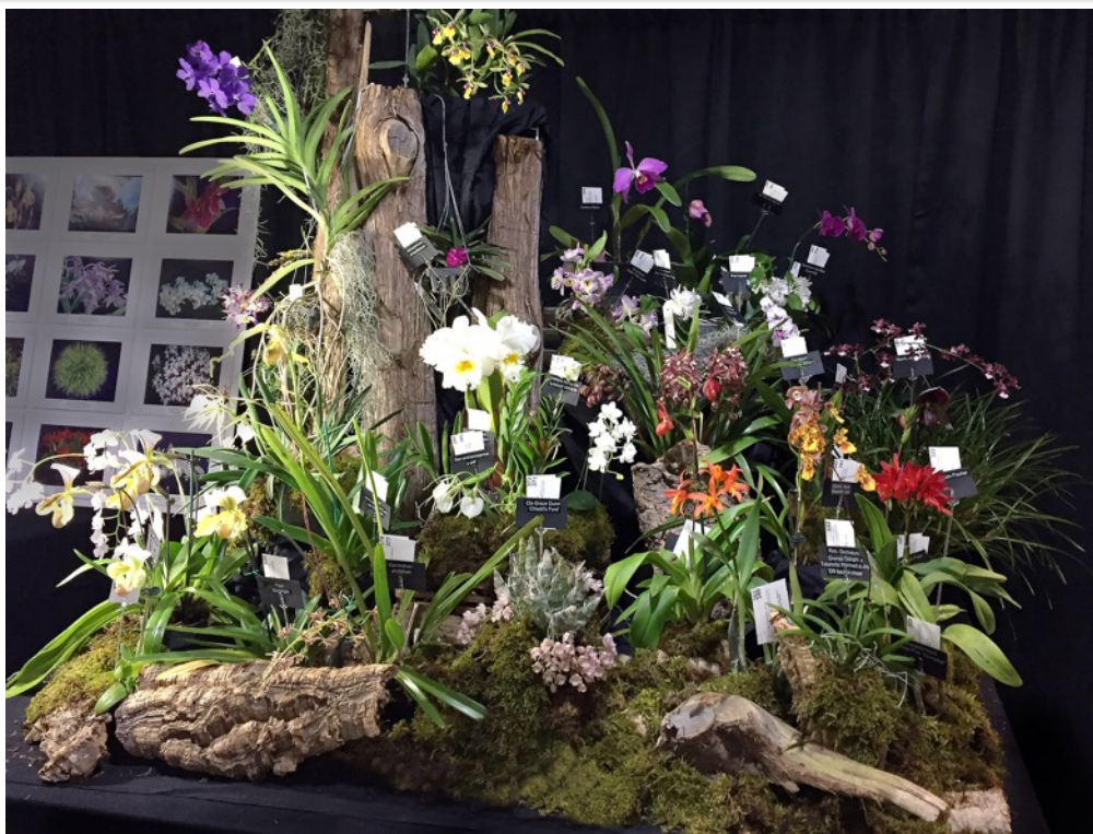
The MOS display at the 2020 Amherst Annual Orchid Show