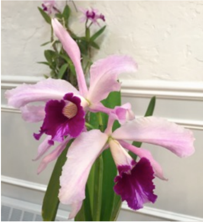
Laelia purpurata 'Flower Power'