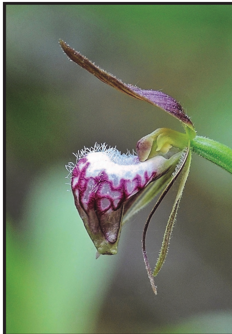
Ram's-head Lady's-slipper ( Cypripedium arietinum )