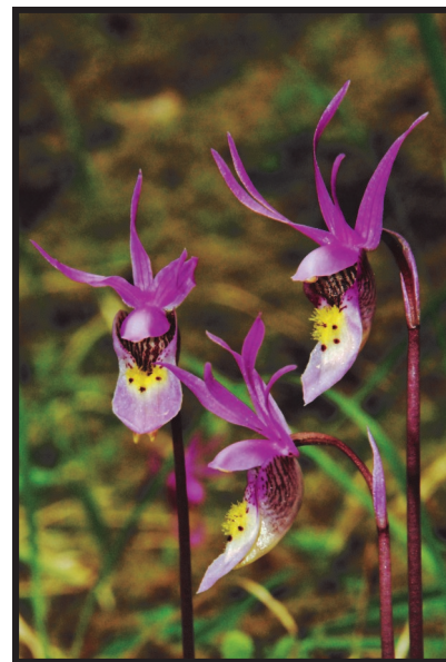
Fairy Slipper Orchid ( Calypso bulbosa )

A most important aspect of this event is the opportunity to meet people who share a common interest in natural history in general and native orchids in particular. Many long-lasting friendships and professional relationships have been formed at NOC symposiums. Why not take this opportunity to renew them and/or make new ones on the wild, wonderful Bruce Peninsula?