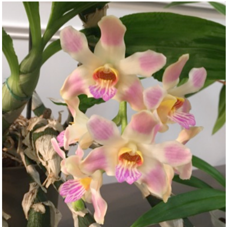
Chysis langleyensis x Chysis limminghei, Brigitte Fortin