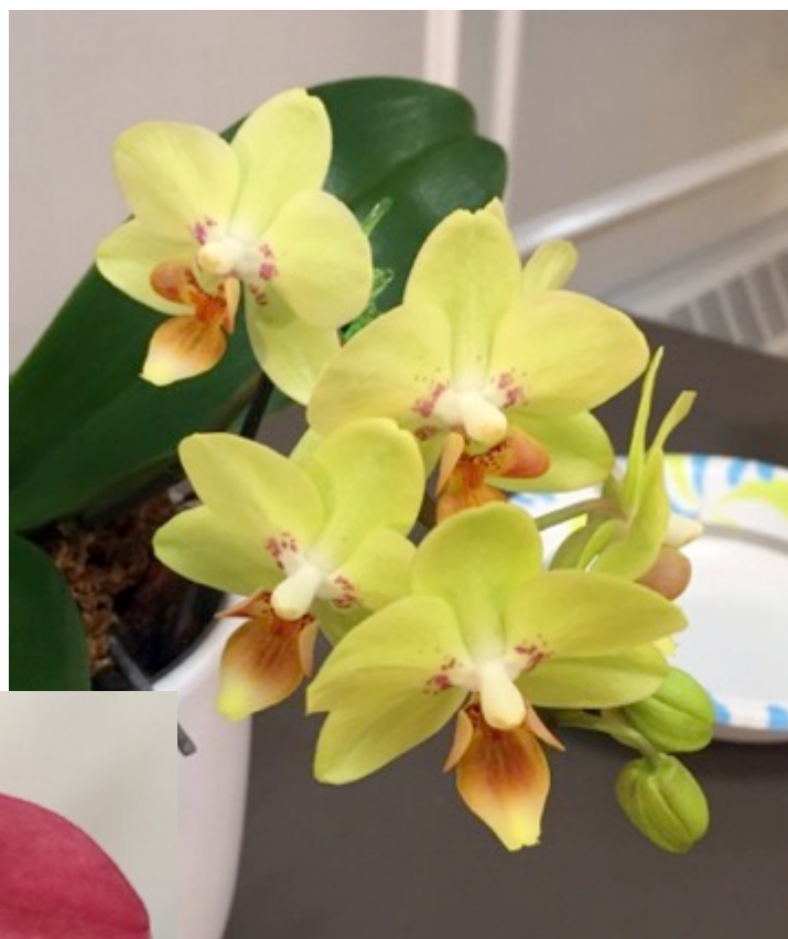
Phal. NoID