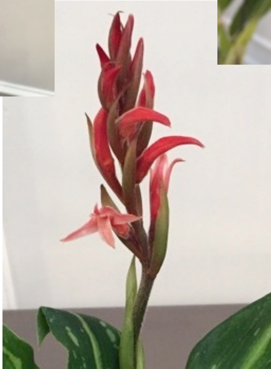
Stenosarcus Vanguard 'Red Stripe', Suzie