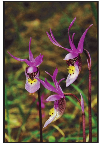
Fairy Slipper Orchid ( Calypso bulbosa )

A most important aspect of this event is the opportunity to meet people who share a common interest in natural history in general and native orchids in particular. Many long-lasting friendships and professional relationships have been formed at NOC symposiums. Why not take this opportunity to renew them and/or make new ones on the wild, wonderful Bruce Peninsula?