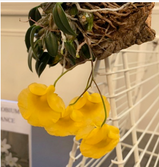
Dendrobium lindleyi or aggregatum