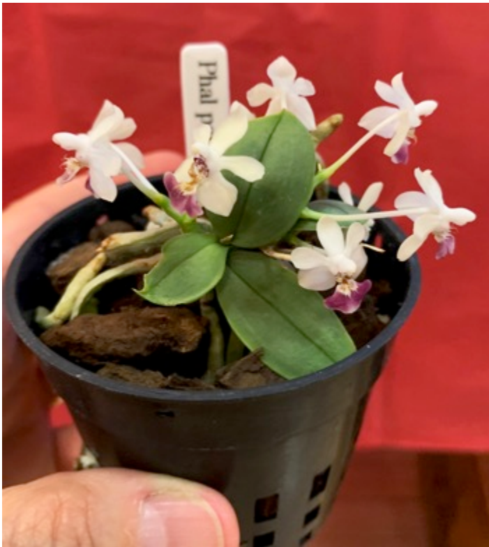
Phal. Haur Jih Fancy 'Taida' (Chingruay's Blood-red x Chingruay's Fancy), ???