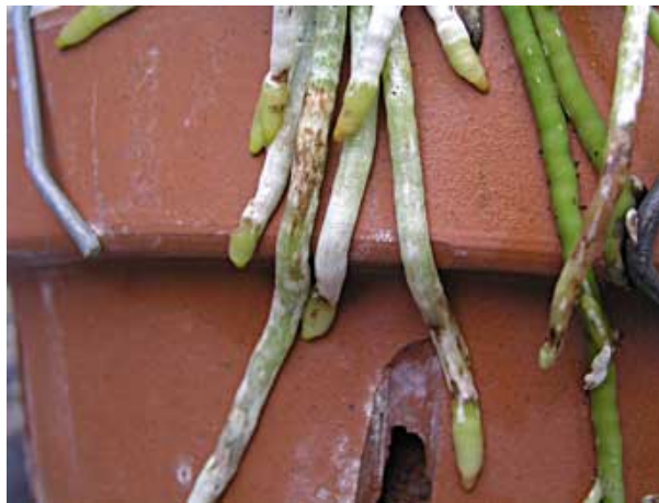
Snails and slugs can cause damage orchid roots to the point where they stop growing. As with any chewing pest, they can spread disease.

This is purported to act as a barrier to slugs and snails, as it holds a small electrical charge that repels the critters. This method is most effective when the plants to be protected are located on a bench or in an area that can be cordoned off by the tape (checking first to be sure that none of these pests are already inside the protected area and will be trapped among your plants). The tape must be at least an inch wide, and can become dirty after a while, necessitating replacement. Its effectiveness is questionable; while some growers swear by it, others seem to swear at it.