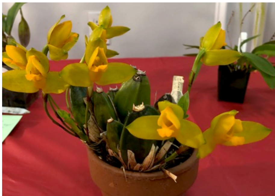
Lycaste aromatica, Linda Abrams

Monthly meeting starts at 7:30 p.m. Please have your plants on the show table by 7 p.m.