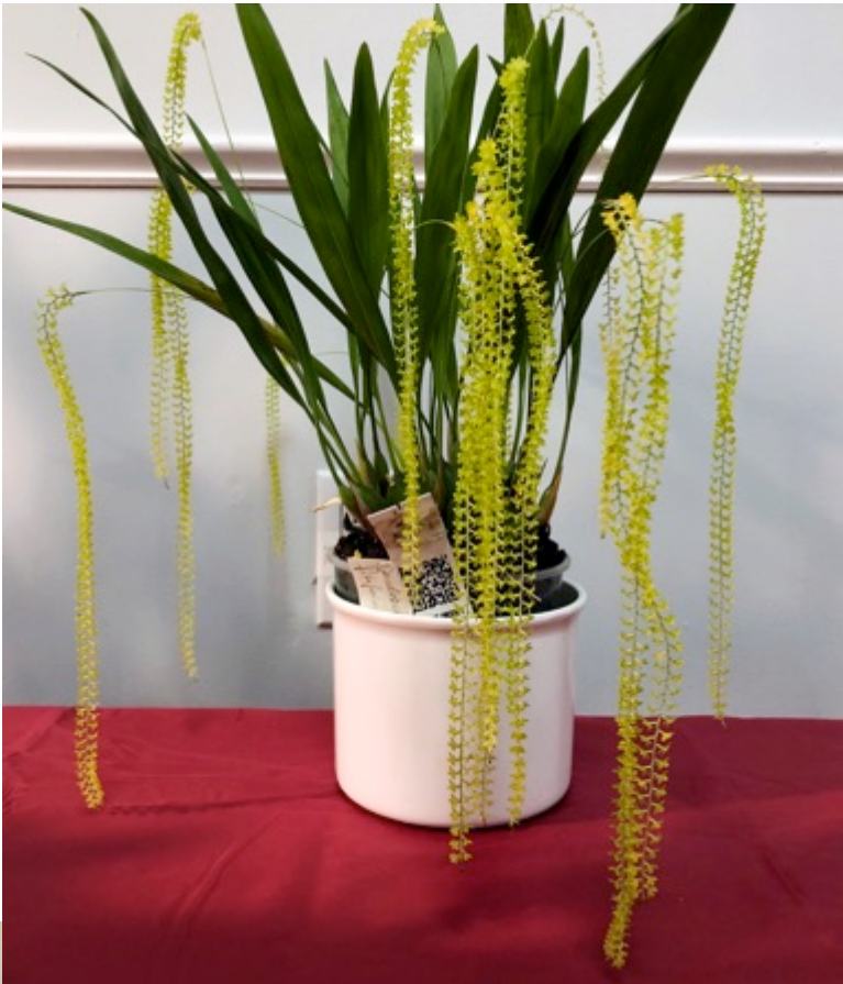
Dendrochilum filiforme , ???