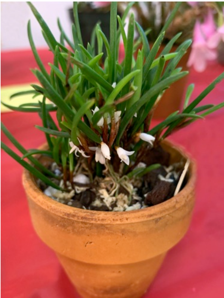
Cerastylis philippinesis, ???