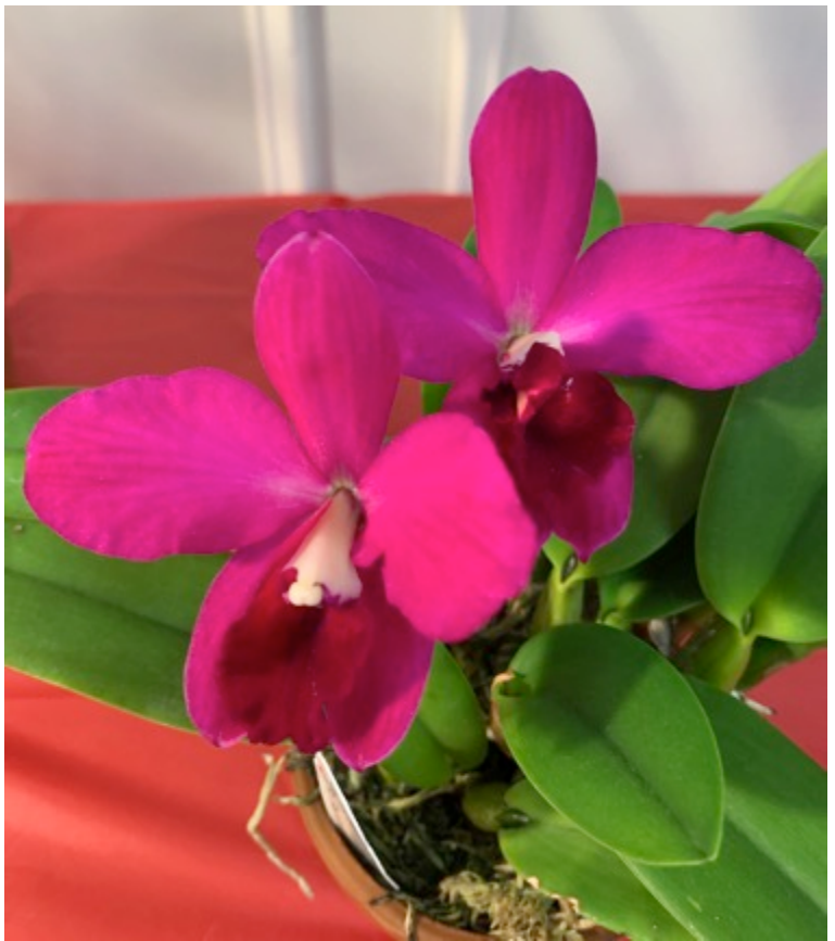
Pot Higher Multiplier 'Shocking Red' x Pot. Blast Furnace 'Red Hot', ???