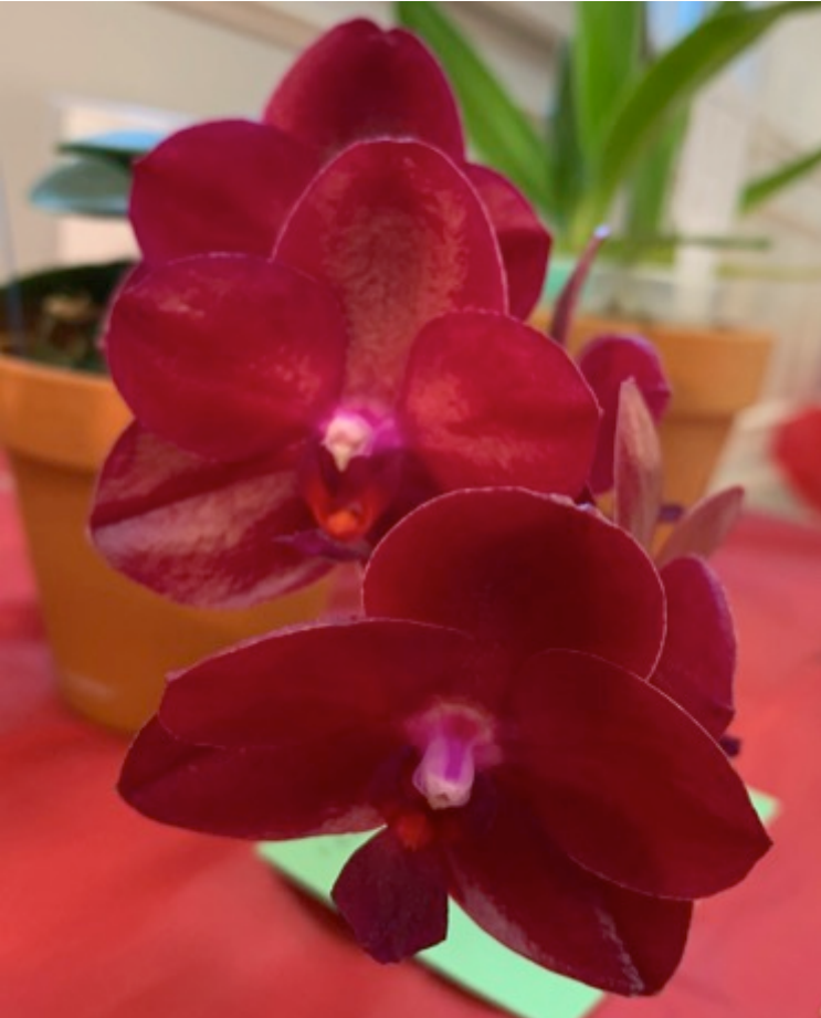
Phal. Haur Jih Fancy 'Taida', ???