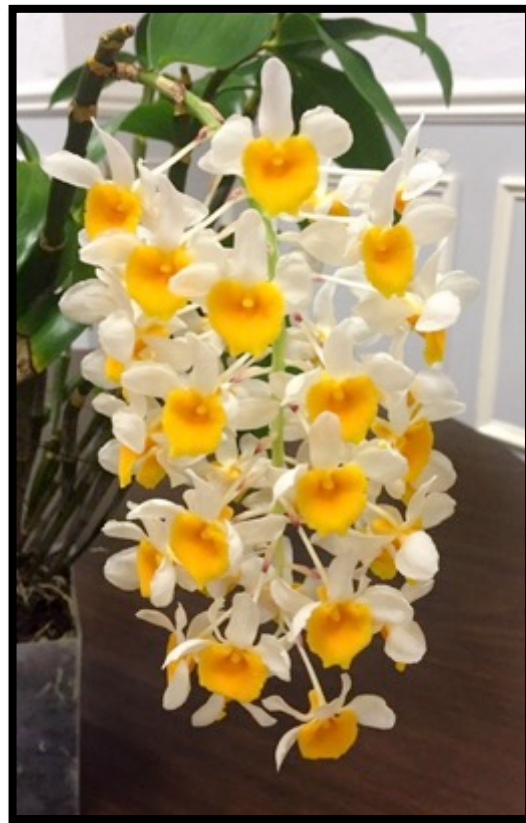
Dendrobium thrysiflorum