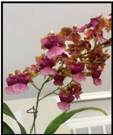
Oncidium Ruffles 'Scent of a Woman', Betsy Opitz