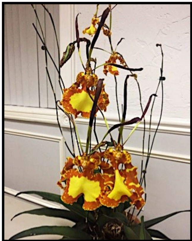
Oncidium papilio Hildo 'Mendenhall' FCC/AOS, Brigitte Fortin