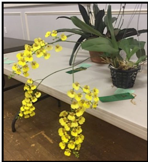
Onc. hybrid, Brigitte Fortin