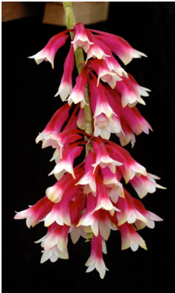
Den. lawesii, a native species of New Guinea