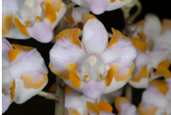
Phal. Pulcherruna 'Lakeview Yellow Splash'

We all have skills that match at least one of these opportunities. You know the drill...review, choose and type your name!