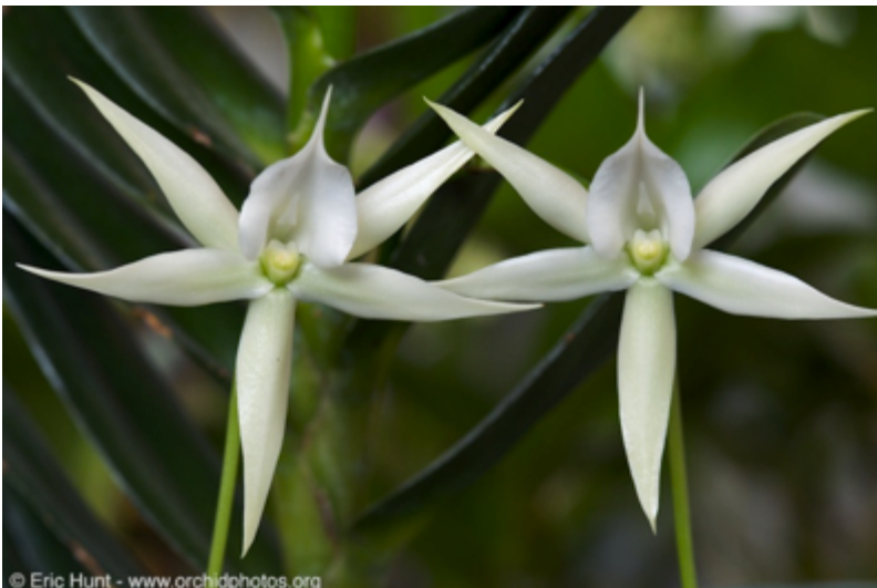
Angraecum (florulentum x eburneum)