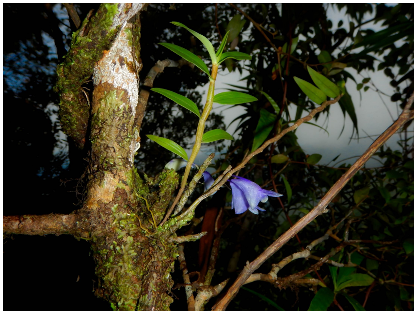
One of the rare blue orchids found growing as an epiphyte on a small tree.

-Budi Mulyanto, Acting Head of West Papua BBKSDA