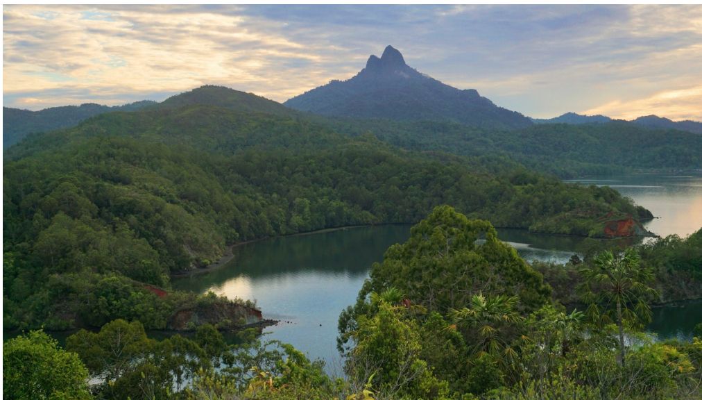
View of Mount Nok, in East Waigeo Nature Reserve.

Known by the Indigenous peoples she encountered as ‘the woman who walks’ and ‘the lady of the mountains’, the former governess found that the hills were alive with the sight of orchids. Cheesman recorded and collected numerous species unknown to the outside world. These included a blue orchid found on the summit of an extinct volcano, Mount Nok, which was among the specimens subsequently bequeathed to the Natural History Museum in London.