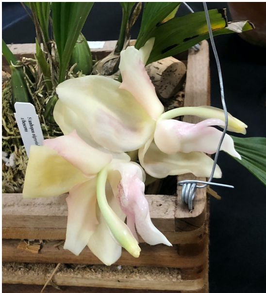
Stanhopea nigroviolacea albescens