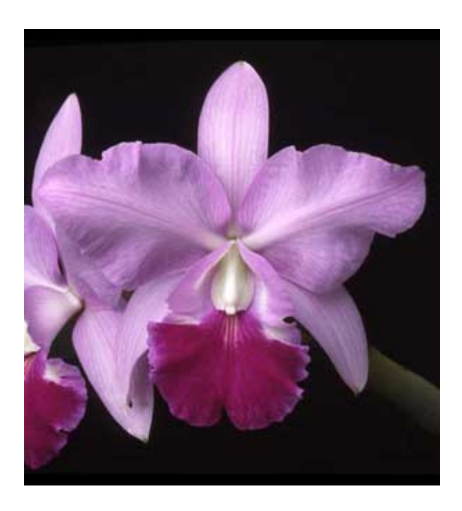
Do You Need A Consultation For Your Plants?